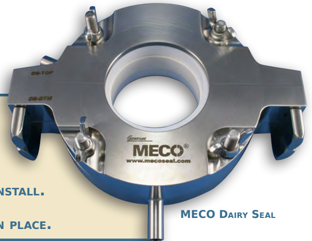
MECO DAIRY SEAL