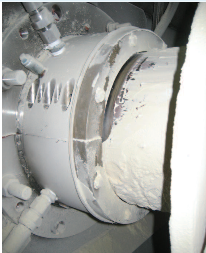
The original packing-gland seal at this soy product manufacturer's plant lost product of up to ½ meter per day.

"The blender's conventional packing gland seals deposited a pile of wasted product over one-half meter deep every day," says Steven Vandevyver, the manufacturer's reliability engineer. "One cause of the leak was a 6-millimeter eccentric runout after the blender shaft had been broken and rewelded several times."